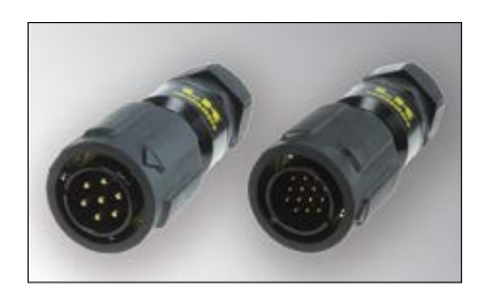
The LK Connectors LKR series connectors are compatible with the industry standard P7 and P14 multipin connectors, and are a perfect match for this cable.

The eurocable CTL series of cables have been specially designed for the special applications of control and power "Fly" cables for chain hoists used in rigging for the entertainment industry. In accordance with ANSI E1.6-4 - 2013 / Rig/2010-2008r2, this cable has been designed without a center conductor as specified in section 8.2.4. "Due to the nature of flex and movement of the hoist power/control cable, a center conductor is subject to extreme tension and pulling forces that can lead to the failure of the hoist to operate or ungrounded conditions, depending on the pinout of the control system."