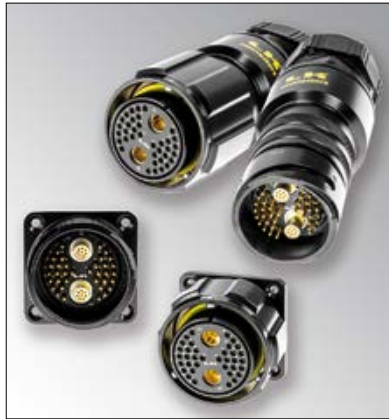
LKG 28/2E36: 2 Gigabit contacts, 36 pins size 18.