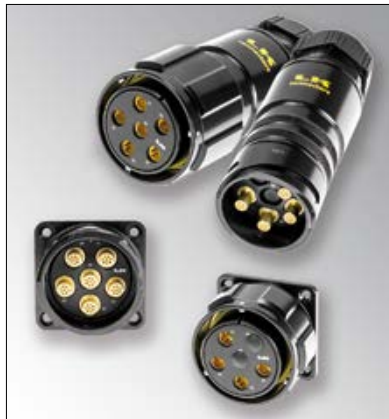
LKG 32/6E, LKG 32/4E: 6 or 4 Gigabit contacts.