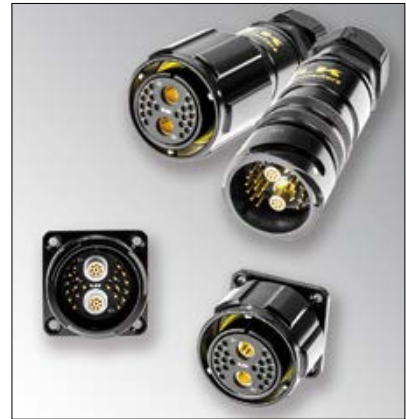
LKG 24/2E20: 2 Gigabit contacts, 20 pins size 18.