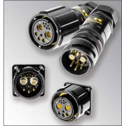
LKG 24/2E10: 2 Gigabit contacts, 3 pins size 12, 1 pin size 16, 6 pins size 18.