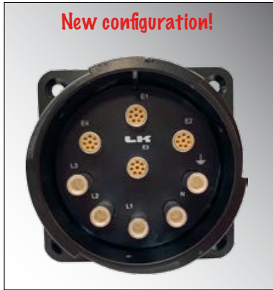
LKG T 32 4E: 4 Gigabit contacts, 5 pins size 8, with fast LinkLock backshell