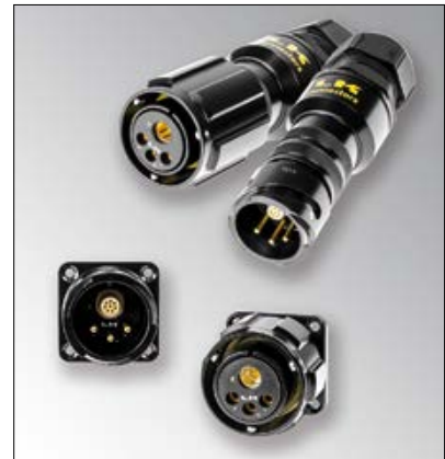
LKG 20/1E3: 1 Gigabit contact, 3 pins size 12.