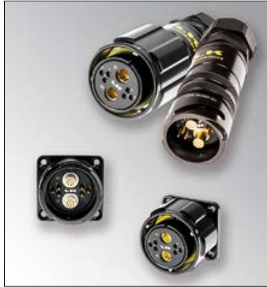
LKG 24/2E6: 2 Gigabit contacts, 6 pins size 16.

The LKG Gigabit series of connectors is ideal for applications that require multiple CAT6A connections + Power. Available with configurations of 1, 2, 4, and 6 CAT6A connections and power from single phase 20A to three phase 30A, LKG is ideal for Front Of House and cross stage connections that require hybrid power + data.