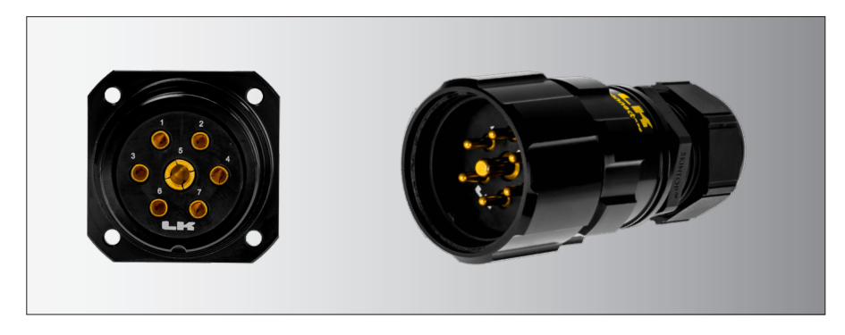
LKSR 7: M32 plastic spring skin top as standard for cable connectors.