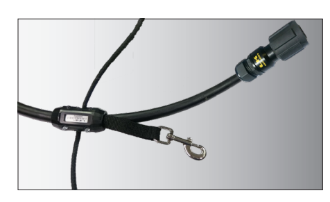
Assemblies available, please contact Link for details and pricing.