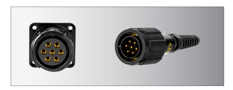
LKR P7: M32 plastic spring skin top as standard for cable connectors.