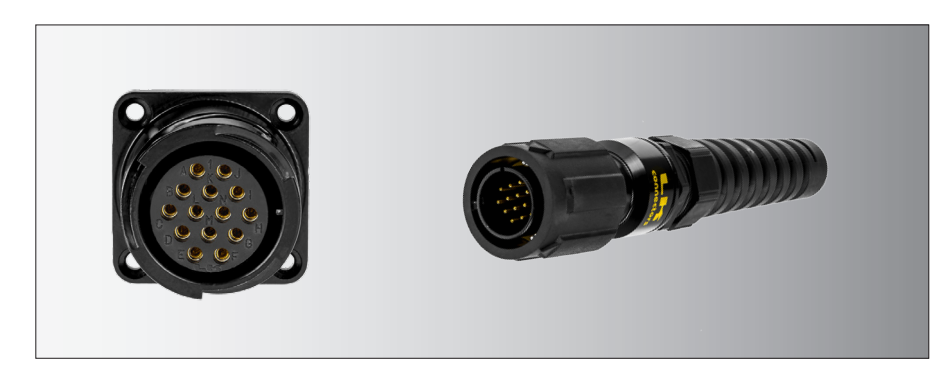
LKR P14: M32 plastic spring skin top as standard for cable connectors.