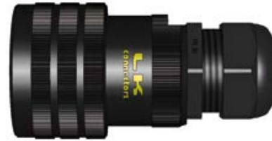
LKI M176 VS