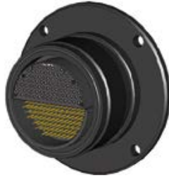
LKI M176 PS